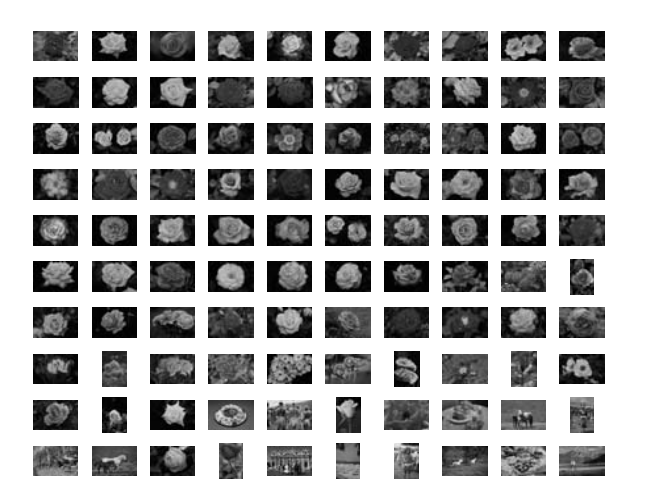
Fig. 4. The retrieved results of BP-based image retrieval system