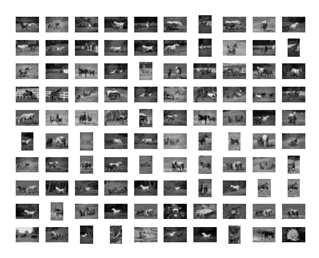
Fig. 3. The retrieved results of BP-based image retrieval system