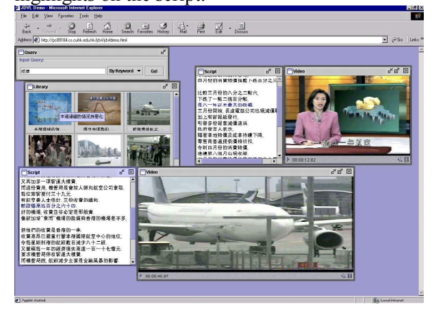
Figure 3. A Java Applet Client

Client Application is the presentation subsystem of XDVL. In essence, it only handles query submission, query result presentation and video playback. In our earlier client prototype (Figure 3), we adopt a Java Applet thin client that allows user to query by title, keyword or script. After submitting the query, the returned results are shown in thumbnails with their titles and short description for user to locate their interested video faster and easier. When the user clicks on a thumbnail, the selected video will start playing in stream with synchronous running highlights on the script.