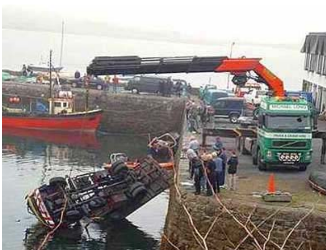
8) Oh no. The Walsh crane is starting to go down!