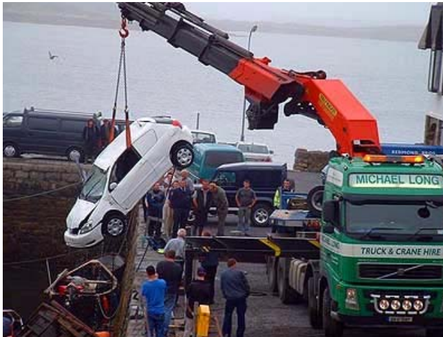
6) The catch of the day.