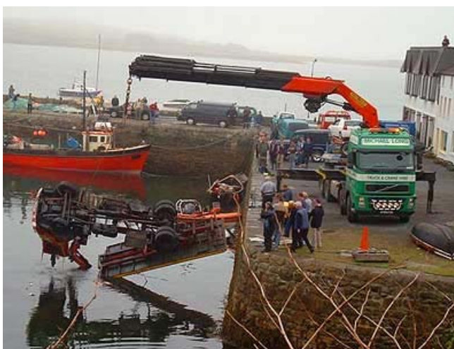
7) Now it's time to pull the Walsh crane out of the water.