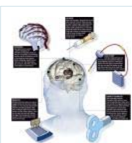
Enlarge image Bionic Brains

Still, the opportunity may be too tempting to pass up. The drug acts only in the brain, claims Lynch. It has a short half-life of hours. Ampakines have been shown to restore function to severely