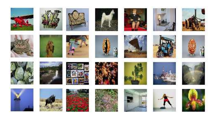
Figure 2. Some images selected from COREL image CDs in our experiment

car , cat , dog , firework , horse and lizard , etc. Fig. 2 shows some images used in our experiment.