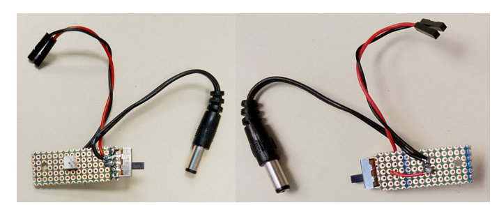
Figure 2: Power switch board.

On the provided prototype board solder the switch and header as shown in the sample board (Figure 2).